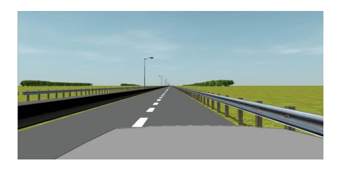
Figure 1: Simulated driving environment.

The non-driving task (see Figure 2) is a modified version of the Surrogate Reference Task (SuRT; [9]). The SuRT resembles a target recognition task, in which participants are required to identify a target item (the letter Q in this study) from amongst a field of distractors (the letter O) and manually select it on a touchscreen located to the right of the participant.