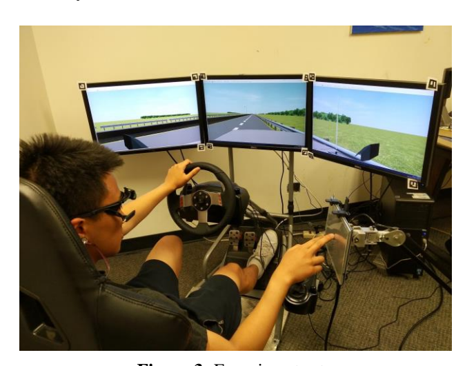
Figure 3: Experiment setup.

console would be in an actual vehicle. A headmounted eye-tracker will be used to collect participant gaze behavior during the study. This device captures video of the wearer's field of view and of the wearer's right eye. The manufacturer's software is used to extract fixation, pupil diameter, and blink rate for analysis. Heart beat rate and heart rate variability will also be collected during the study.